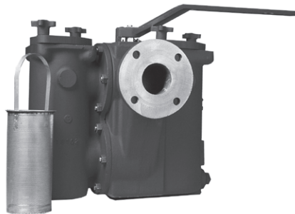
Models 792FB, 794FB

Strainers provide economical protection for costly pumps, meters, valves, and other similar mechanical equipment by straining foreign matter from the connected piping system. Installation of a strainer before mechanical equipment can ensure trouble free service and avoid costly shutdowns for repair or replacement of equipment damaged by foreign matter. The size of the perforation or mesh in the basket screen will determine the smallest particles captured. See Strainer information section of the Mueller Steam Specialty Engineering binder for detailed information including sizes and materials available.