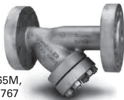
Models: 764, 765M, 766M, 767

Class 600 Class 900 Class 1500 Class 2500